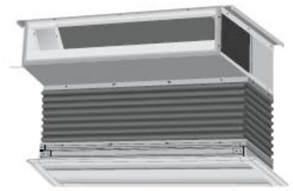
shown with optional grill and canvas accessories