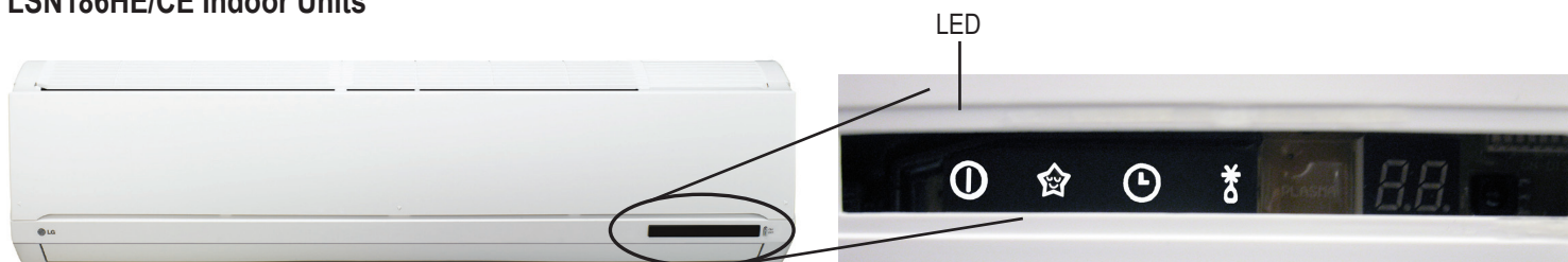
Location of light-emitting diode (LED) display