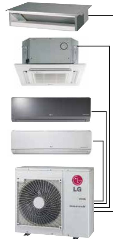
Figure 3: Quad-Zone (LMU30CHV and LMU36CHV) Multi F Heat Pump Inverter System — Mix and match for 14,000-40,000 (LMU30CHV) and 14,000-48,000 Btu/h (LMU36CHV).