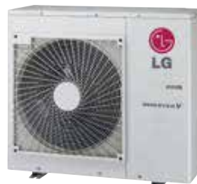
Quad-Zone Multi F