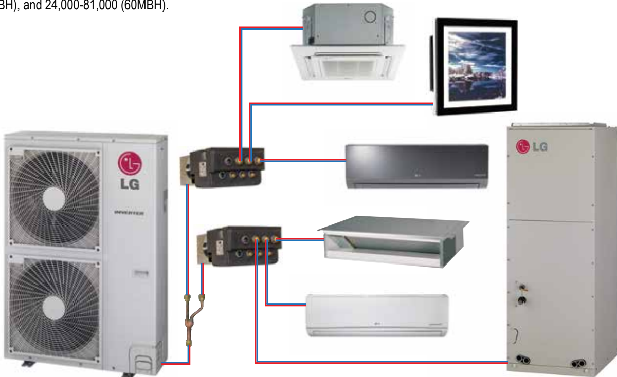
Figure 4: LMU480HV, LMU540HV, and LMU600HV Multi F MAX Heat Pump Inverter System — 21,000-65,000 Btu/h (48 MBH), 22,000-73,000 (54MBH), and 24,000-81,000 (60MBH).