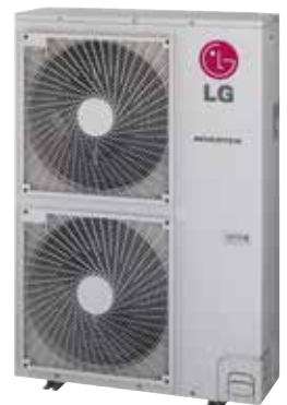
Eight-Zone Multi F MAX