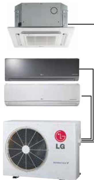
Figure 2: Tri-Zone (LMU24CHV) Multi F Heat Pump Inverter System — Mix and match for 14,000-33,000 Btu/h.