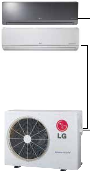
Figure 1: Dual-Zone (LMU18CHV) Multi F Heat Pump Inverter System — Mix and match for 14,000-24,000 Btu/h.

Multi F / Multi F MAX Heat Pump System Combination Data Manual