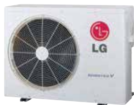
Dual and Tri-Zone Multi F